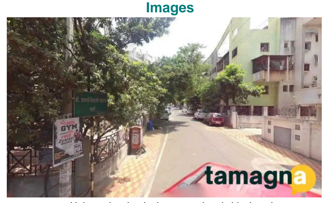
Universal technologies pune pimpri chinchwad

If necessary to adjust any detail that you think is not accurate regarding this web, we urge you to deliver a message and we will fix it as soon as possible. In advance we appreciate it.