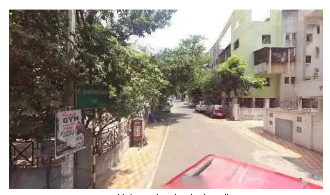
Universal technologies all