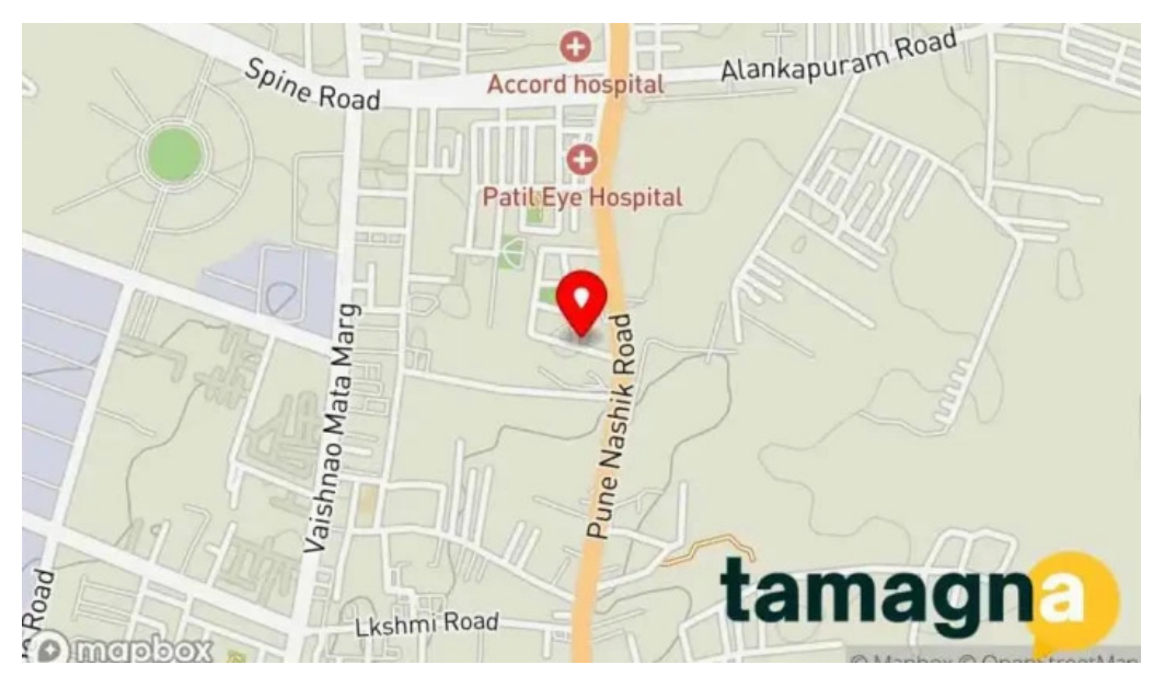
Universal technologies map