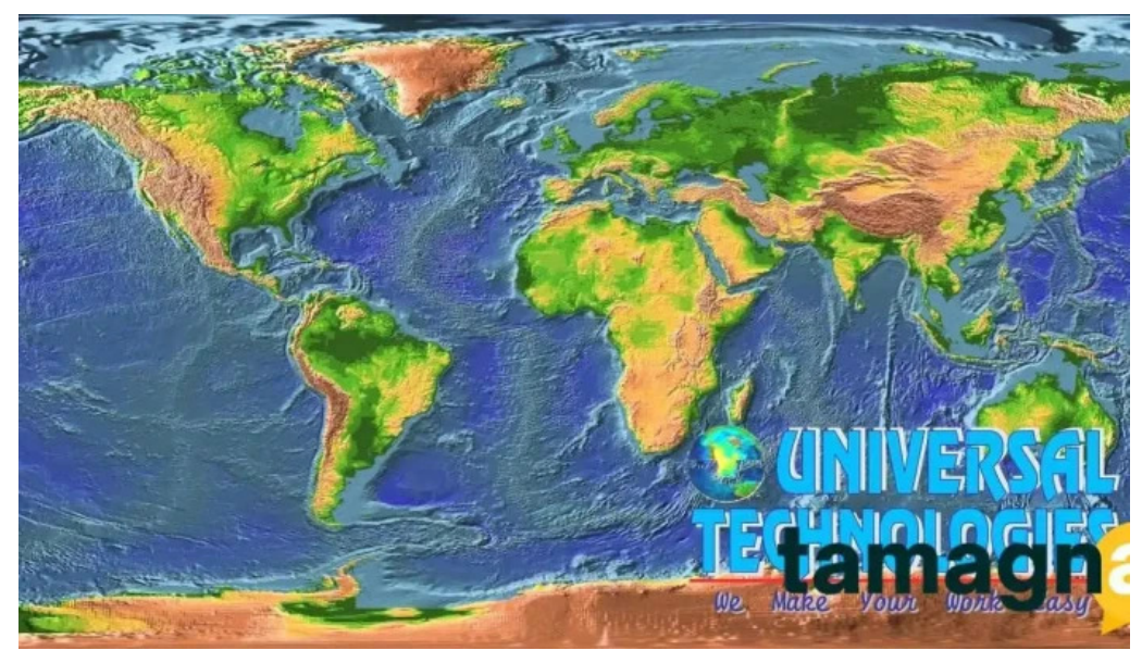
Universal technologies by owner